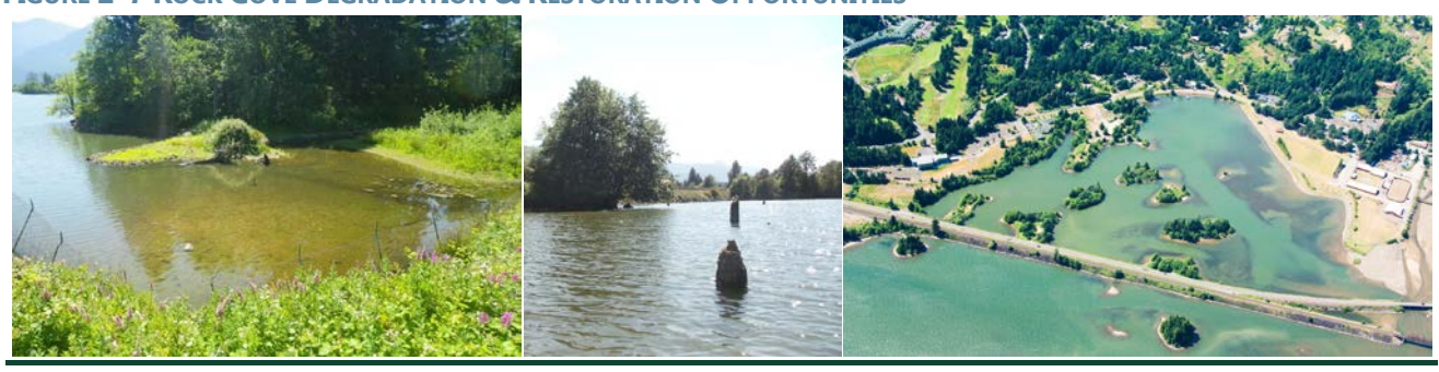
Rock Cove Degradation & Restoration Opportunities Pilings, fences, & dredge basins provide visible relics of Rock Cove's industrial past.