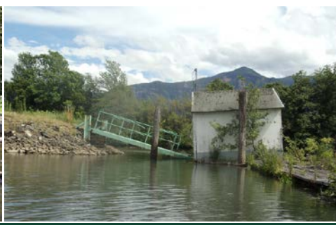
Figure 4.4-3 Potential Restoration Opportunities, Rock Creek Reach 1 Untreated stormwater outfall & abandoned residence. Rock Creek Drive bridge & protective pilings. Abandoned tug boat dock.