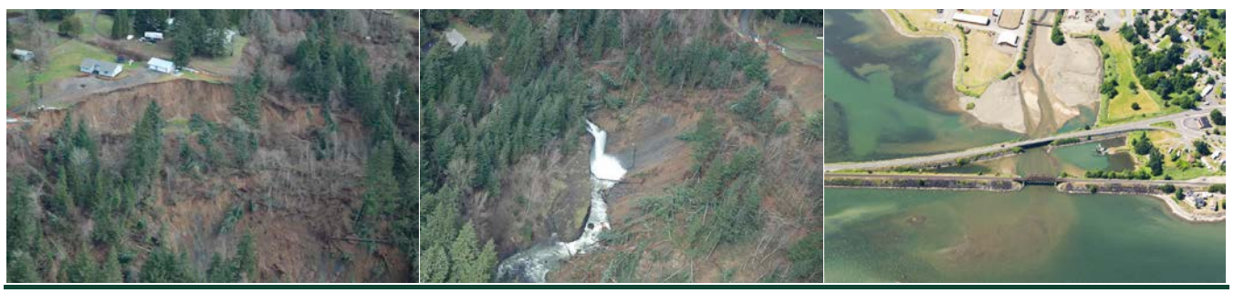
FIGURE 2-6 ROCK CREEK REACH 2 DEGRADATION & RESTORATION OPPORTUNITIES

Rock Creek Reach 2 Degradation & Restoration Opportunities Scarp of Piper Road Landslide at Rock Creek's First Falls & resulting aggradation in Lower Rock Creek.