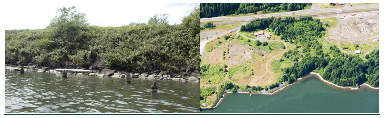
FIGURE 2-4 WEST URBAN AREA DEGRADATION & RESTORATION OPPORTUNITIES

Columbia River Reach 3 Degradation & Restoration Opportunities