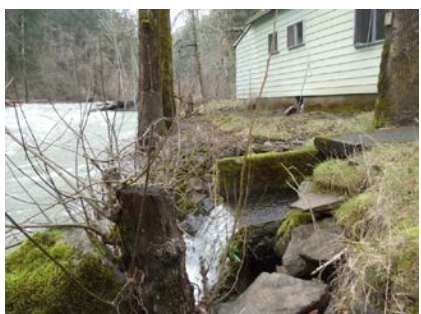
FIGURE 2-5 ROCK CREEK REACH 1 DEGRADATION & RESTORATION OPPORTUNITIES

Rock Creek Reach 1 includes the shoreline jurisdictional area associated with Rock Creek within the City's boundaries. On the east side of this stream, this reach covers the area within city limits from the approximate extension of Lasher Street downstream to the BNSF railroad trestle. This reach also runs along the west/south side of the stream from Ryan Allen Road at the upstream end to the BNSF railroad trestle at the downstream end. The southwestern boundary of this reach at the Rock Cove reach is hard to pinpoint, running southward over the Creek's deltaic deposits toward the trestle. This reach includes ~10,375 linear feet of shoreline, 44 acres of shorelands, and 4 acres of water within shoreline jurisdiction. This reach is not a shoreline of statewide significance.