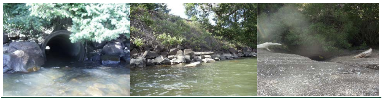
Columbia River Reach 1 Degradation & Restoration Opportunities Differing culvert sizes & elevations, Riprap slopes, and Invasive species along the SR 14/BNSF railroad berm

The degraded areas and restoration opportunities identified in this reach include: