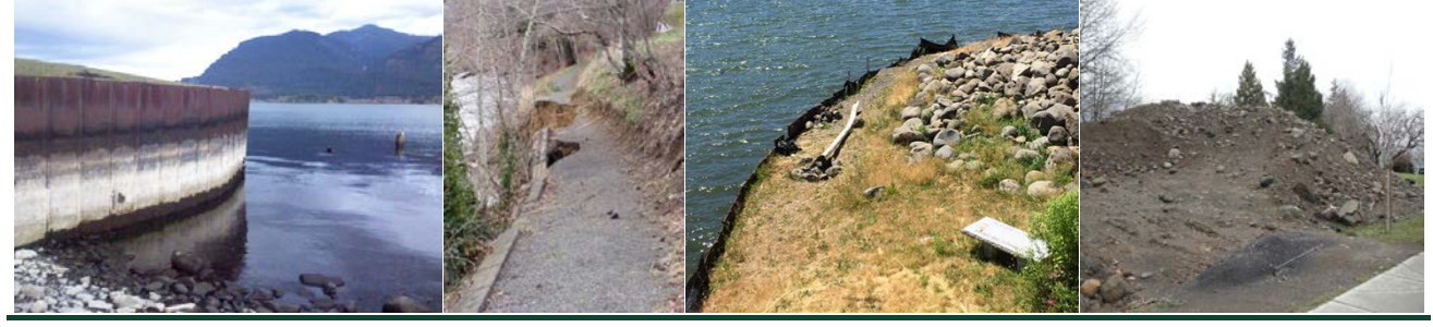
Columbia River Reach 2 Degradation & Restoration Opportunities Sheetpile, active erosion, and staging along the Port of Skamania's Stevenson Shoreline Restoration & Enhancement Project