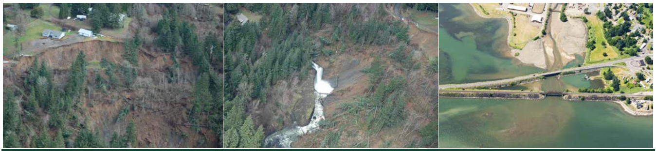
FIGURE 2-6 ROCK CREEK REACH 2 DEGRADATION & RESTORATION OPPORTUNITIES

Rock Creek Reach 2 Degradation & Restoration Opportunities