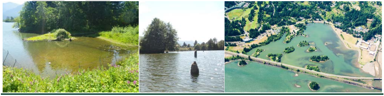
FIGURE 2-7 ROCK COVE DEGRADATION & RESTORATION OPPORTUNITIES

Rock Cove Degradation & Restoration Opportunities Pilings, fences, & dredge basins provide visible relics of Rock Cove's industrial past.