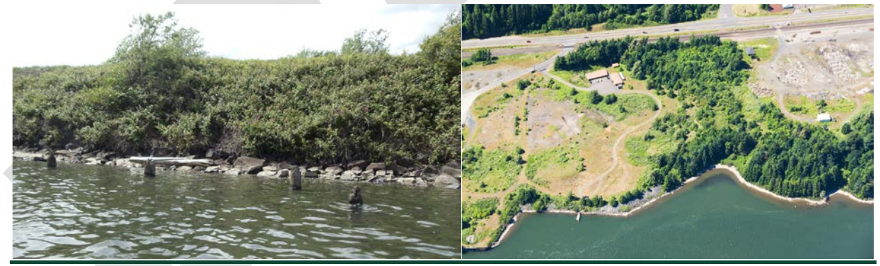
FIGURE 2-4 WEST URBAN AREA DEGRADATION & RESTORATION OPPORTUNITIES

Columbia River Reach 3 Degradation & Restoration Opportunities Derelict piles, riprap slopes & invasive species on the SR 14/BNSF rail road berm. Former industrial development.