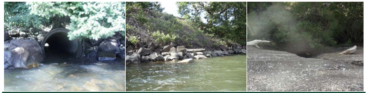
Columbia River Reach 1 Degradation & Restoration Opportunities Differing culvert sizes & elevations, Riprap slopes, and Invasive species along the SR 14/BNSF railroad berm

The degraded areas and restoration opportunities identified in this reach include: