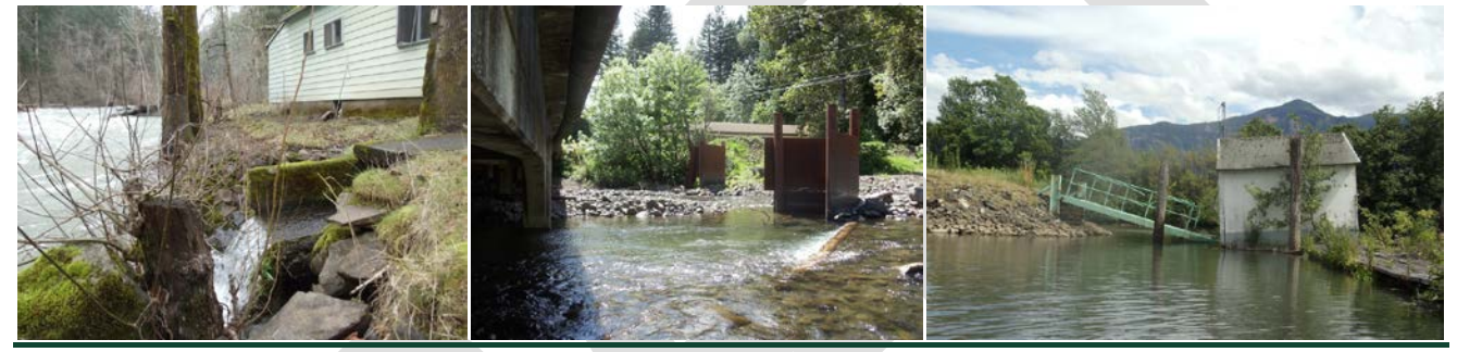
Figure 4.4-3 Potential Restoration Opportunities, Rock Creek Reach 1 Untreated stormwater outfall & abandoned residence. Rock Creek Drive bridge & protective pilings. Abandoned tug boat dock.

The degraded areas and restoration opportunities identified in this reach include: